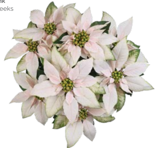
J'Adore White Pearl 10155 | 7.5 weeks