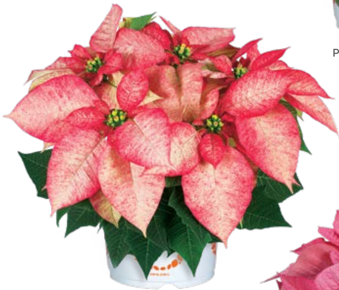
Premium Picasso 10234 | 7.5 weeks