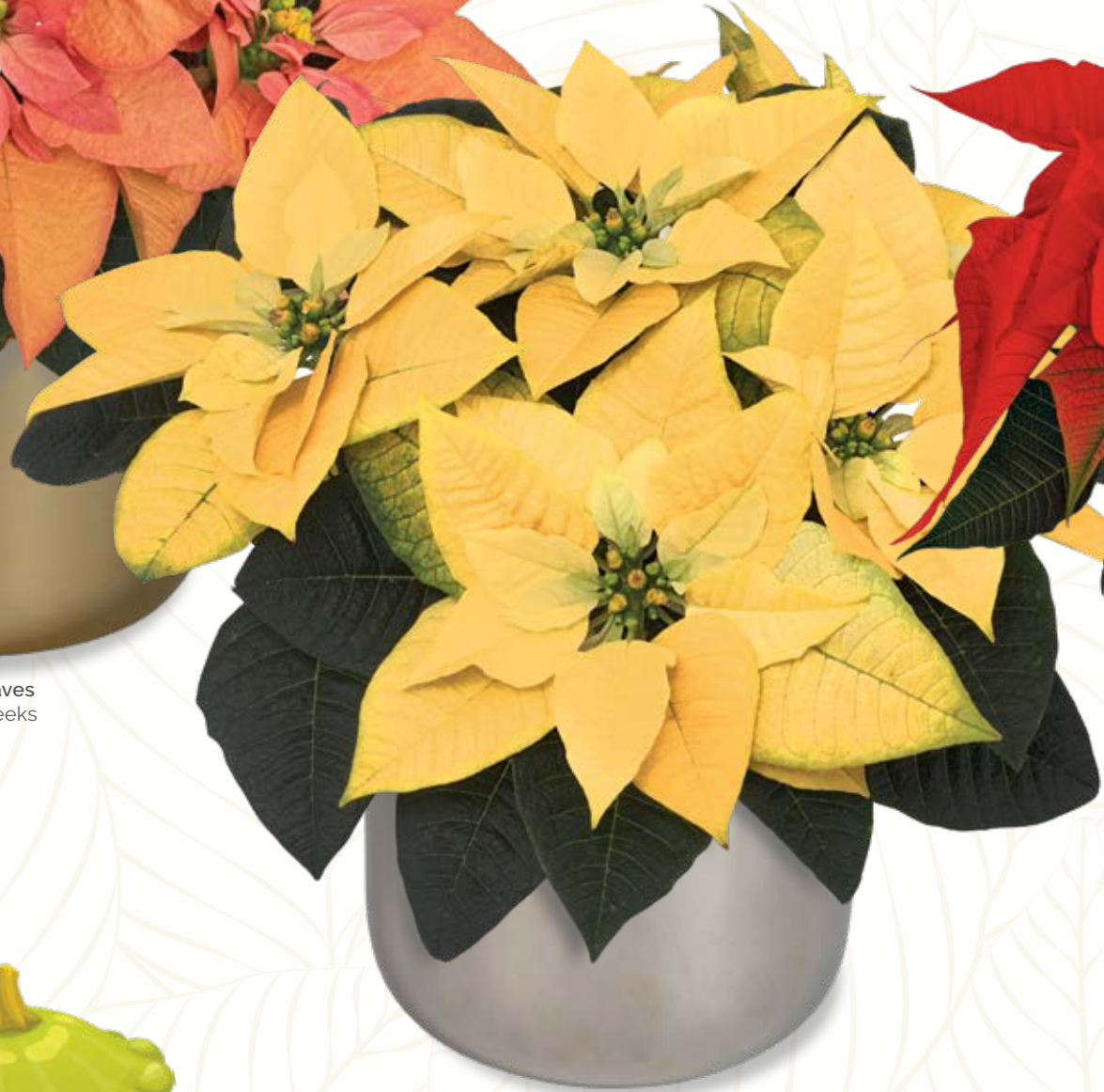
Golden Glo 11431 | 8 weeks