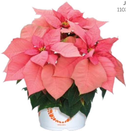
Jubilee Pink 11035 | 8 weeks