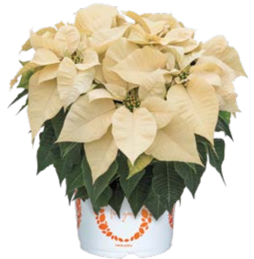
Jubilee White 11033 | 8 weeks