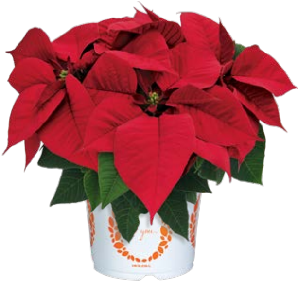
Premium Early Red 10241 | 6 weeks

The Premium Family has been a legacy program for greenhouse growers around the world. This exceptional collection has the traditional reds and white, but also many unique standouts like Ice Crystal and Picasso. Premium varieties finish early with lower vigor for small- to mid-sized containers and early season sales.