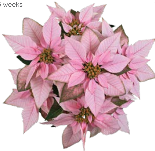
J'Adore Soft Pink 10156 | 7.5 weeks