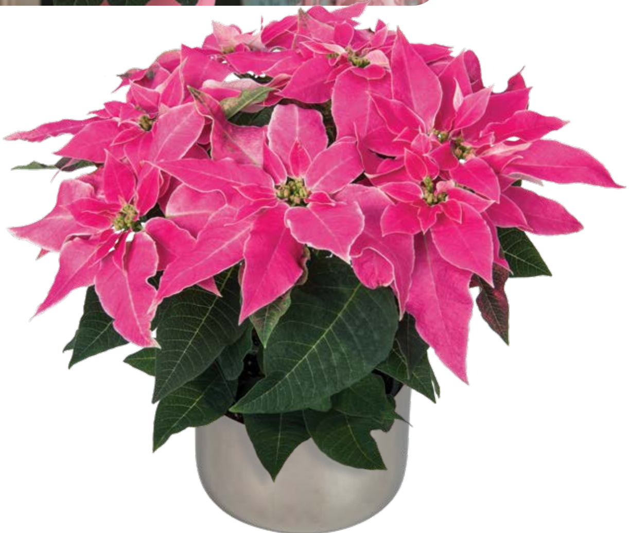
Luv U Pink 11109 | 9 weeks

A standout in any setting, Luv U Pink is an explosive plant. The most vigorous in its class, it is suitable for larger containers as well as the landscape. It has a later response time compared to other euphorbias.