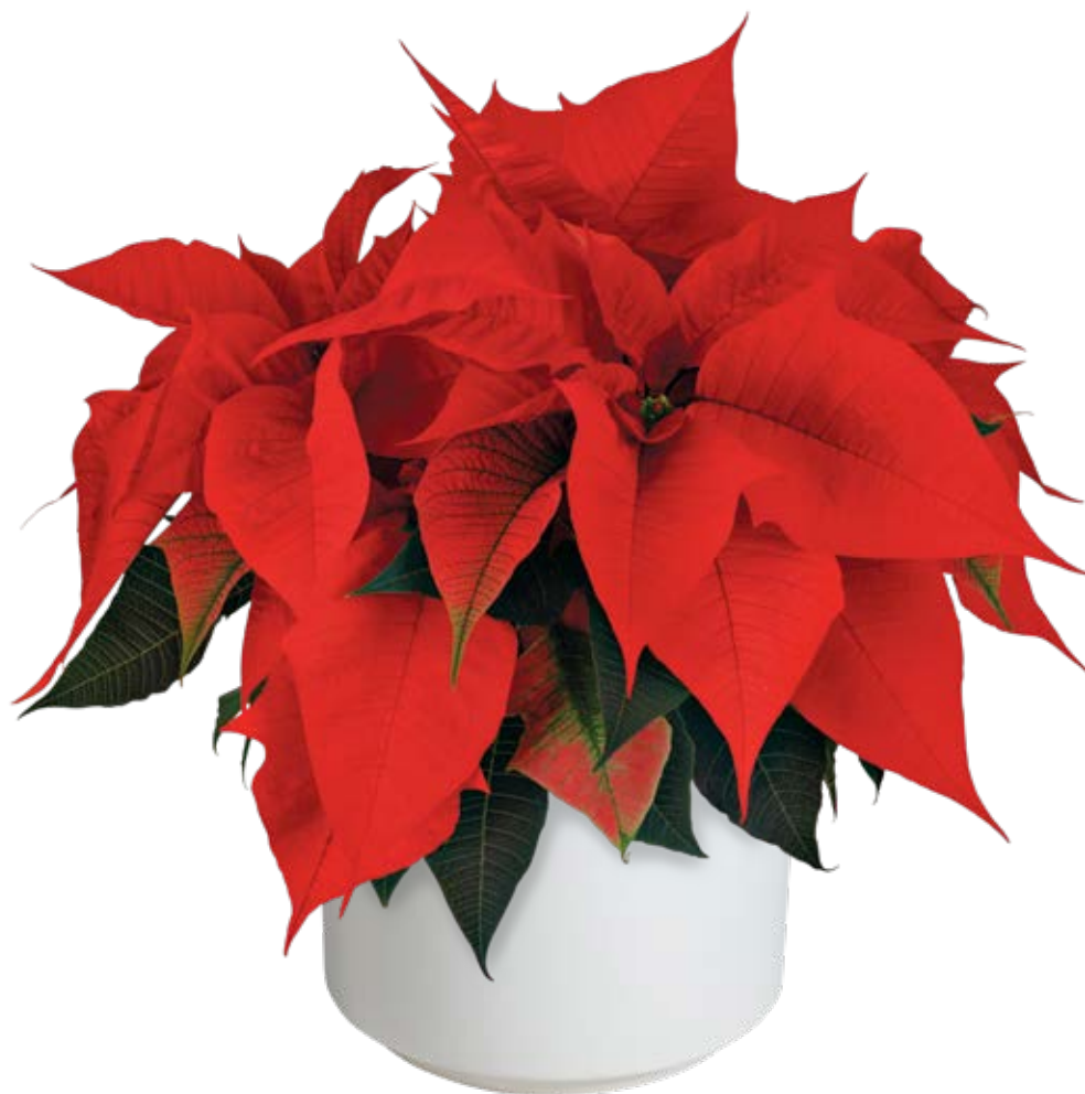
Norwin Orange 11081 | 8 weeks

Norwin Orange is a true breakthrough for this novel color. By far the brightest orange available on the market today. This mid-vigor variety has immense bracts in a vivid color perfect for Halloween and Thanksgiving promotions. Named after a long-time partner of the Ecke program, Norwin Heimos, this variety will also be a legacy in poinsettia programs for years to come.