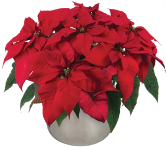
Advent Red 11008 | 6.5 WEEKS

Very early variety with large bracts and cyathia. Advent Red is known for its landscape performance in southern climates.