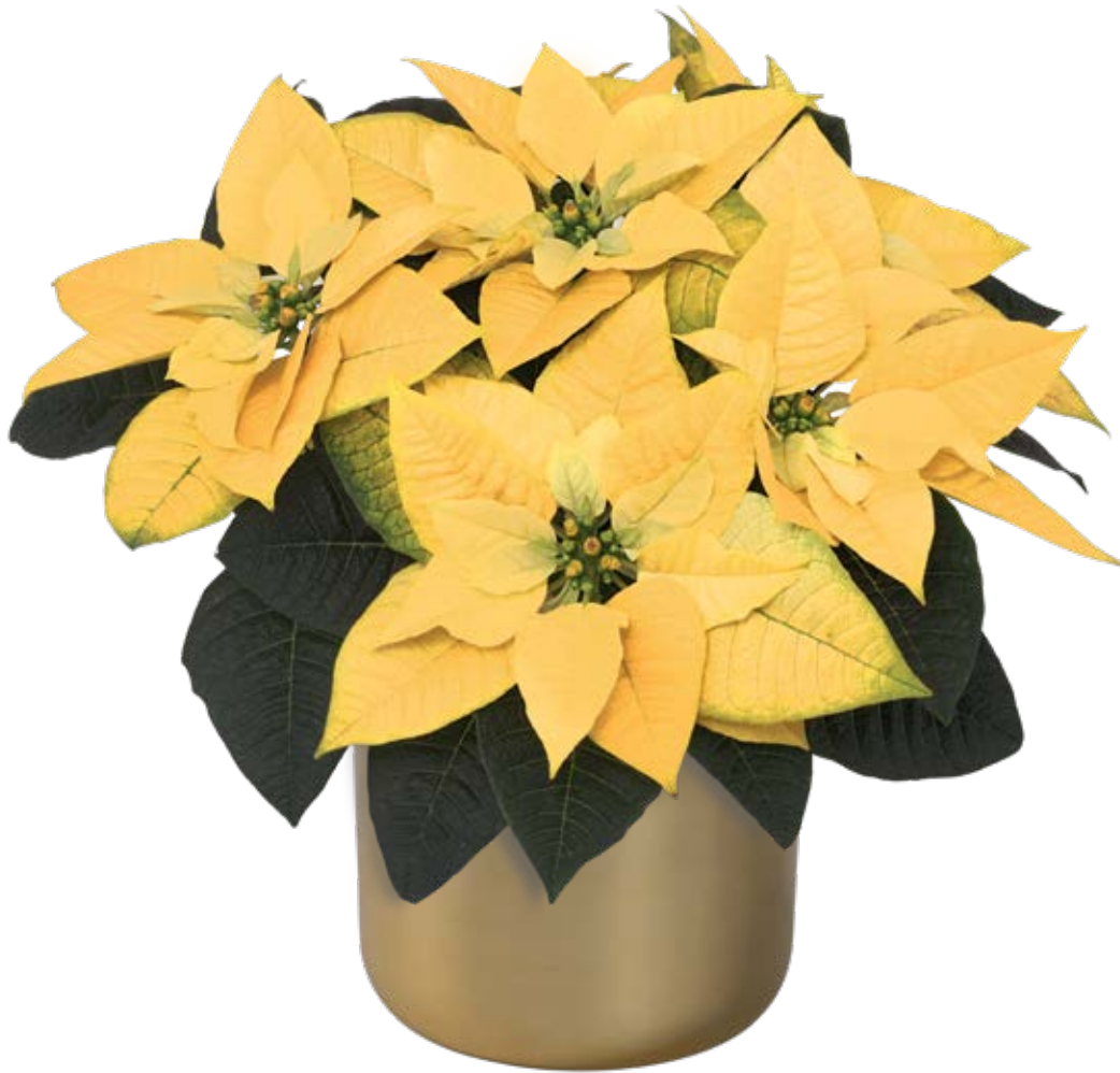
Golden Glo 11431 | 8 weeks

The unique golden color of Golden Glo intensifies as the bract matures – a striking choice for red and gold holiday pairings.