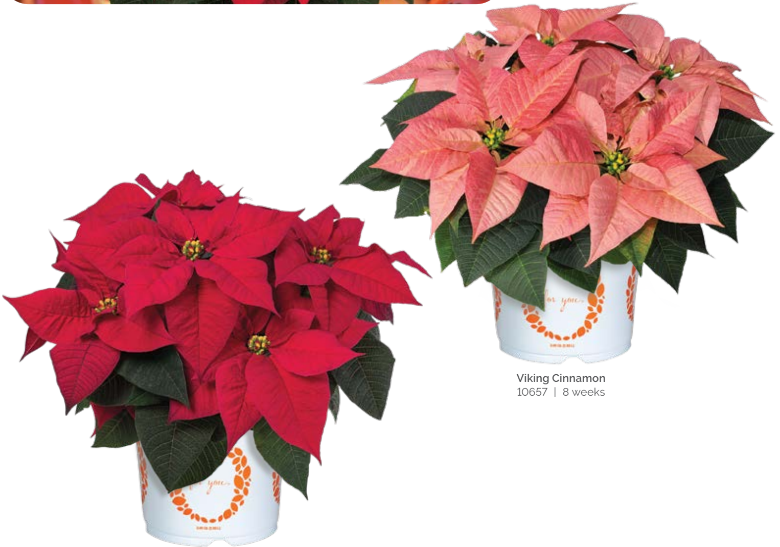
Viking Red 10650 | 8 weeks

This mid-season collection is both heat tolerant and well-suited for cold finishing. Red and the unique Cinnamon display a V-shaped architecture that is perfect for high-density production.