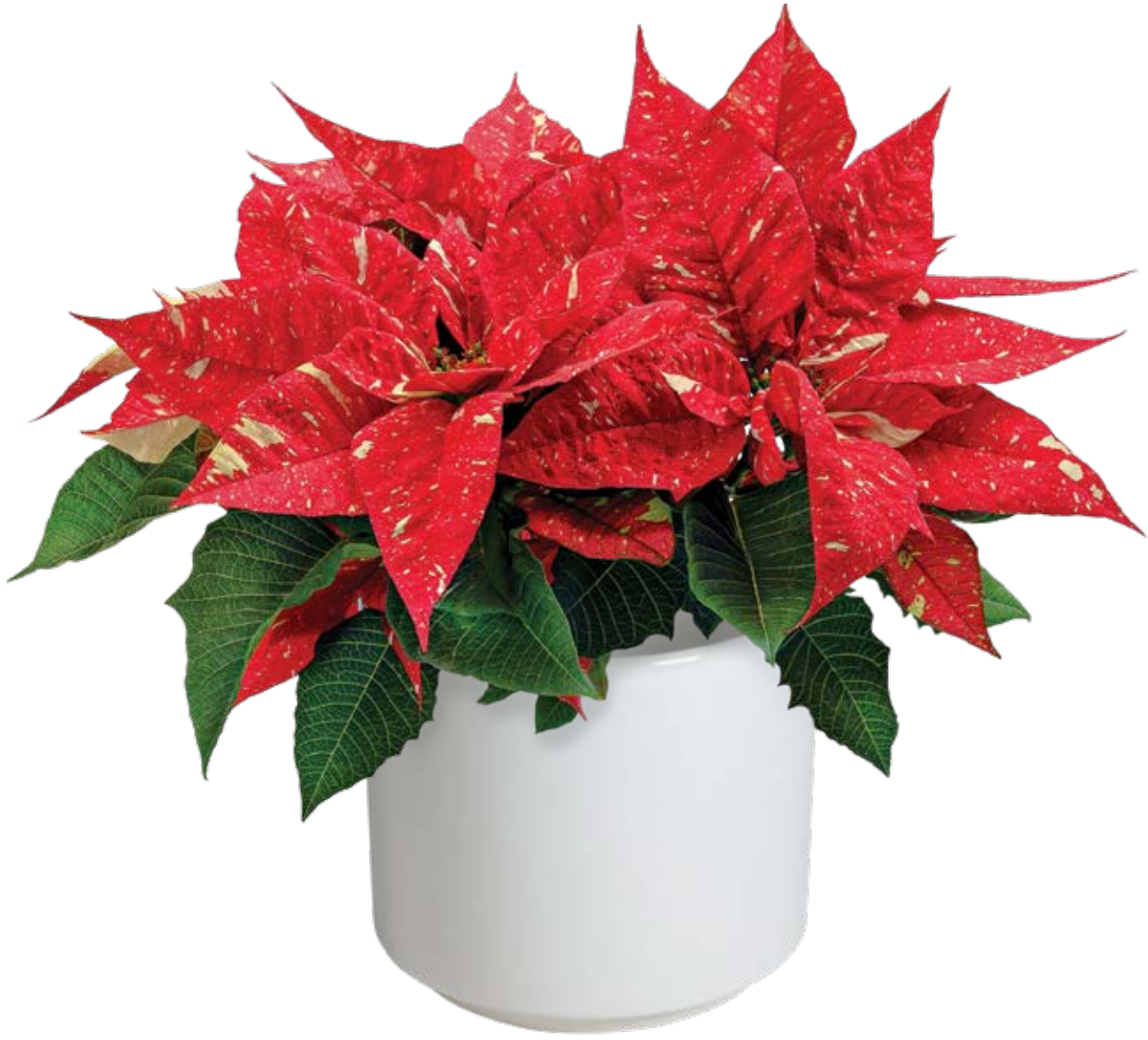
Candy Cane 10153 | 8 weeks

This truly special selection presents red bracts embellished with fun, white speckles, providing a striking contrast against dark-green foliage. The classic star-shaped bracts are large and showy and create an impressive display at retail. Strong stems and a strong root system make this poinsettia an excellent choice for a range of container sizes, from miniature up to 10-inch.