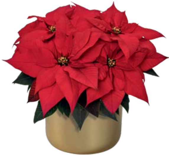
Ferrara 10897 | 7.5 weeks

Strong vigor and a fast response time make this standout a top pick for the grower. This reliable variety offers excellent branching and a V-shaped habit making it ideal for production sleeving and production. It is a newer stand-alone selection that boasts beautiful, deep-red bracts and is perfect as an upscale decoration.