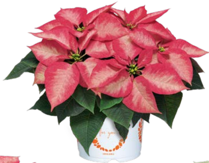
Premium Ice Crystal 10244 | 7.5 weeks