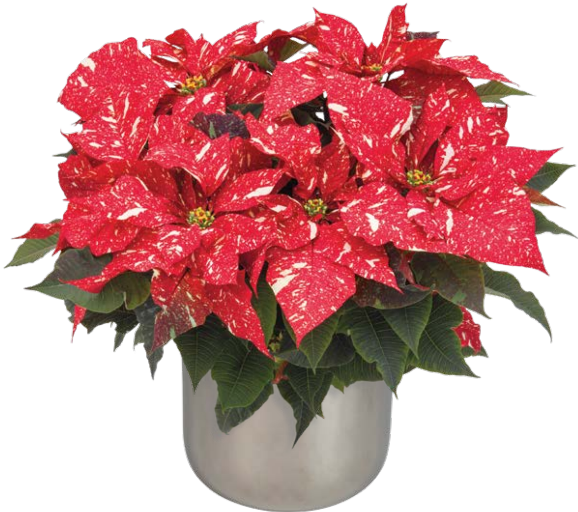
Red Glitter 11317 | 8.5 weeks

Striking colors with horizontal bracts. Heat-tolerant and ideal for tree forms with superior post-production characteristics.