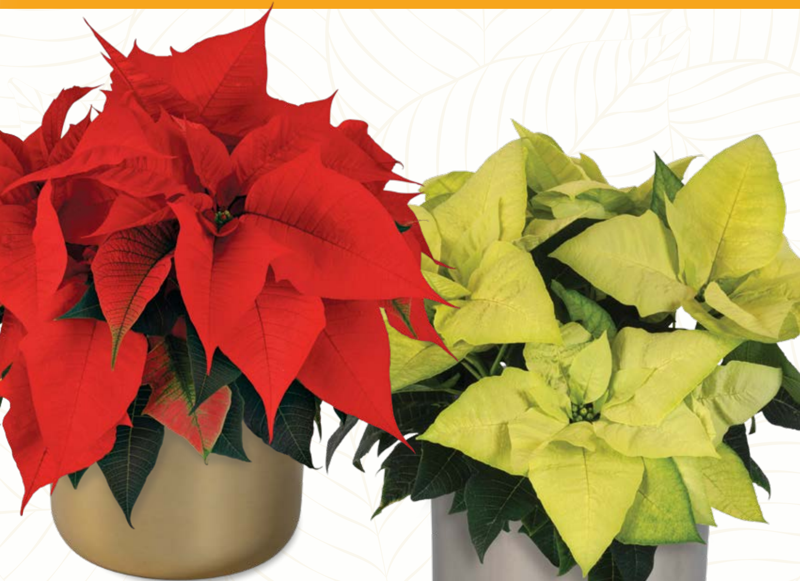
Norwin Orange 11081 | 8 weeks

Our diverse novelty poinsettia breeding offers beautiful autumnal tones that go beyond traditional reds. Natural early timing allows growers to easily offer an early assortment at retail; no black cloth is required to achieve pre-Thanksgiving sales! These early performers with warm autumn hues are the perfect way to earn holiday sales faster. Autumn Leaves has become a consumer staple for Thanksgiving tablescapes and will transition beautifully into your Christmas decor. Paired with the brilliant Norwin Orange, illuminating Golden Glo and the unique Green Envy, this becomes the perfect collection for stylish autumn merchandising.