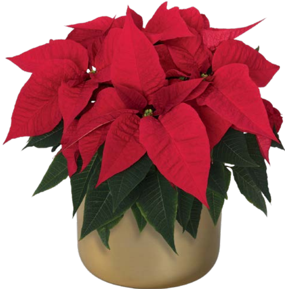
Southern Belle 10908 | 8.5 weeks

Southern Belle is a beautiful florist-type poinsettia for December sales. It is a medium vigor plant with bright red bract and a strong v-shaped structure.