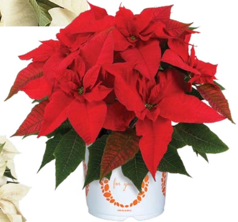
Classic Red 11180 | 8.5 WEEKS