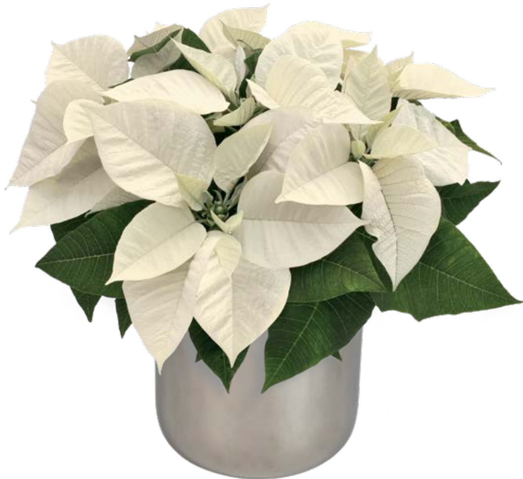
Polar Bear 11208 | 8 weeks

Excellent, bright-white bracts over variegated transitional bracts for a unique look.