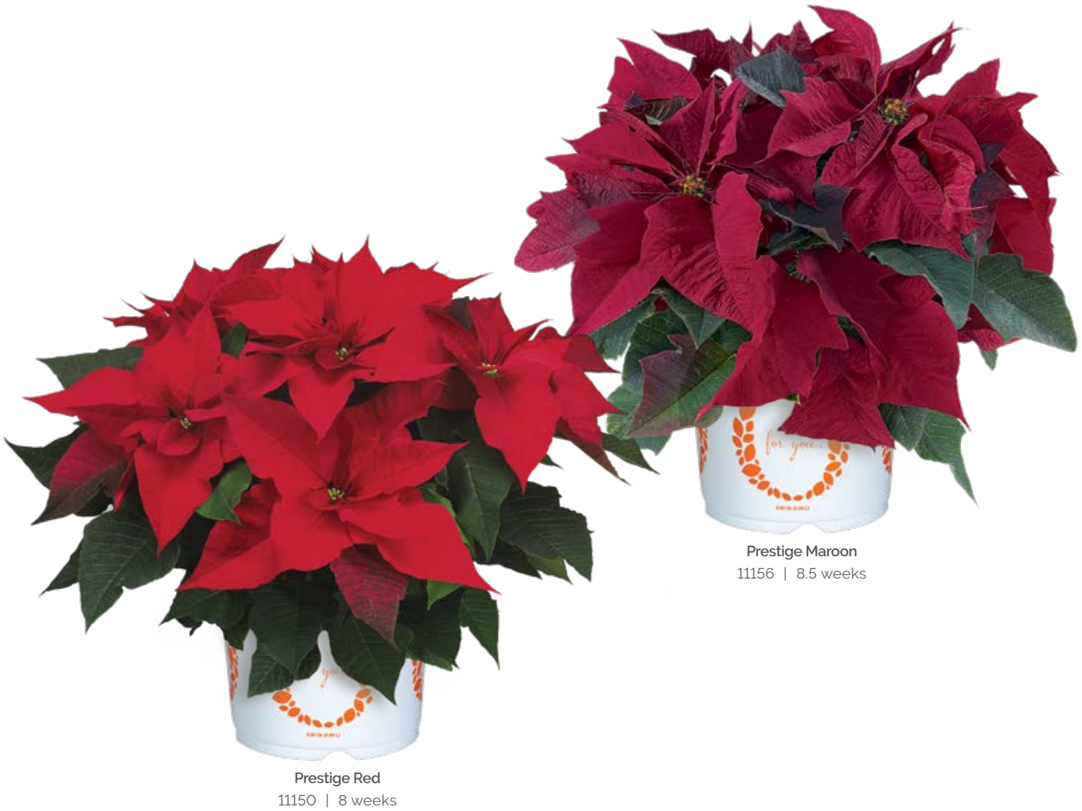
Prestige Red 11150 | 8 weeks

This mid-season collection stands out at retail with reliable and long-lasting shelf life. Prestige is versatile in use and adaptable to any container size.