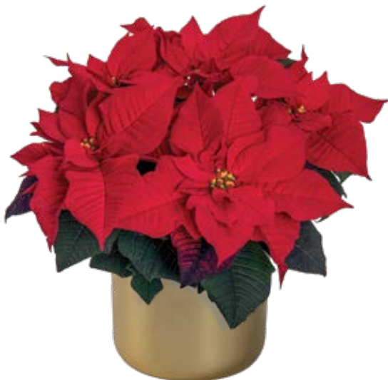
Red Soul 11323 | 8 weeks

This gorgeous mid-season variety's deep velvet-red bracts are striking against intense, dark-green foliage. A standout in all climates, especially the South, Red Soul exhibits excellent heat tolerance on a medium-vigor plant.