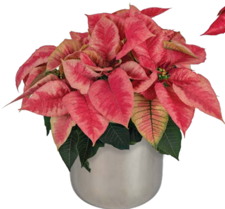
Tidings Light Pink 11048 | 8 WEEKS

Tidings varieties are an elegant addition to the modern-day Christmas décor. Both Tidings Light Pink and Tidings Dark Pink are reverse sports from one another, making them an ideal pair in both production and retail settings. These varieties have a dense, medium habit with large, florist-quality bracts finishing with a sophisticated quality.