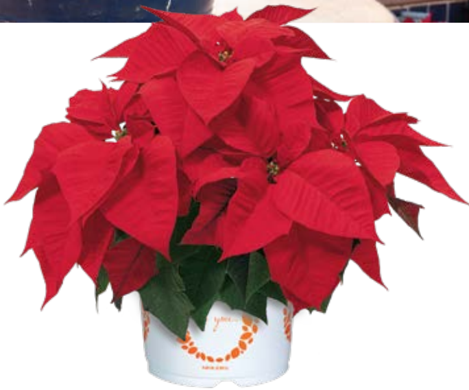
Freedom Early Red 11191 | 7 weeks

More vigorous than the Premium lineup, Freedom varieties are suitable for medium to large containers, which they fill well with large bracts and strong branching. Four colors are available that play well together in combinations.