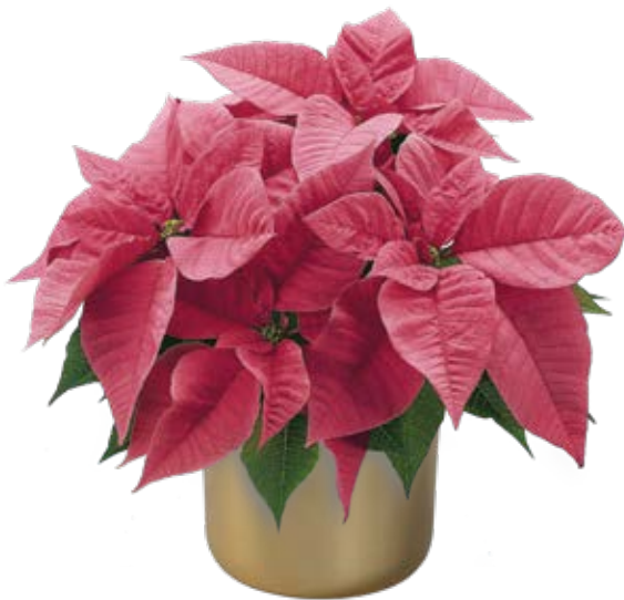
Maren 10416 | 8 weeks

Excellent pink with strong vigor that is suitable for large containers.