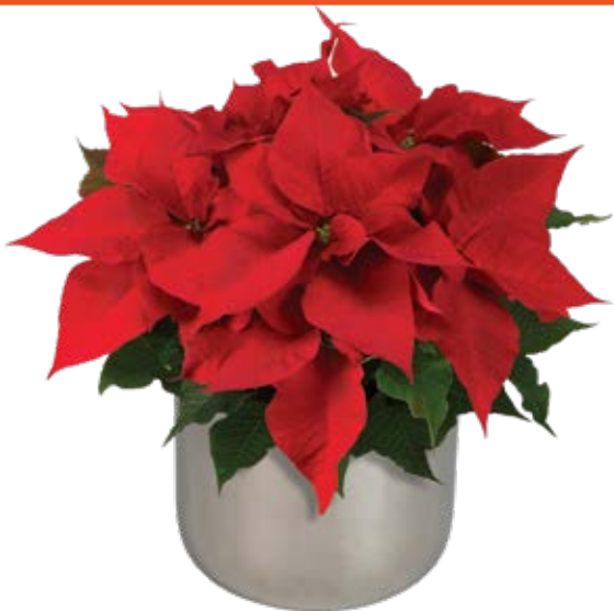
Prestige Early Red 11151 | 7.5 weeks

Prestige Early Red has predictable growth throughout the season.