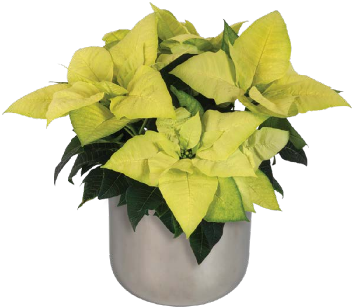
Green Envy 11433 | 7.5 weeks

Green Envy will keep spirits bright. The large, bright chartreuse bracts have outstanding contrast against the dark green foliage and make a bold holiday statement mixed both in our Fall Favorites, as well as with classic reds during the Christmas season.