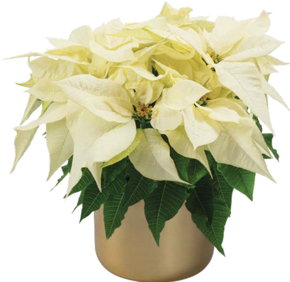
Frozen 11056 | 8 weeks

One of the cleanest and purest white poinsettias available, consumers will appreciate how the bracts simply light up against the dark foliage.