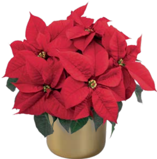
Atla 11423 | 8 weeks

This strong, bright-red mid-season performer is a perfect pick for mass production. Atla has a strong V-shaped habit, perfect for high-density production, and the medium-sized bracts make sleeving and shipping a breeze.