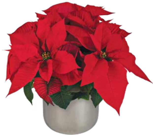
Runway Red 10101 | 8 week

Runway Red will grab attention with the large, vivid red bracts and boldly presented cyathia. This industrial strength variety has strong vigor and a broad and spacious habit for bold presentations, while also having the durability to go the distance throughout the season.