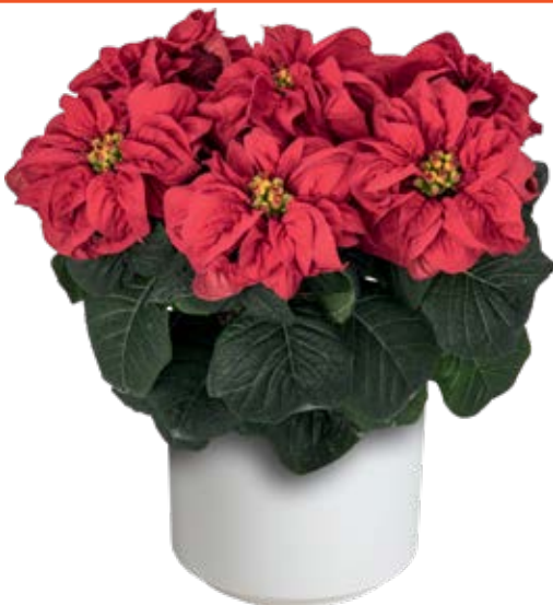
Winter Rose Early Red 10993 | 7.5 weeks

An early-season specialty variety, Winter Rose Early Red have ruffled bracts which resemble roses. The narrow plant habit is great for straight-ups and combination plantings for a unique holiday look.