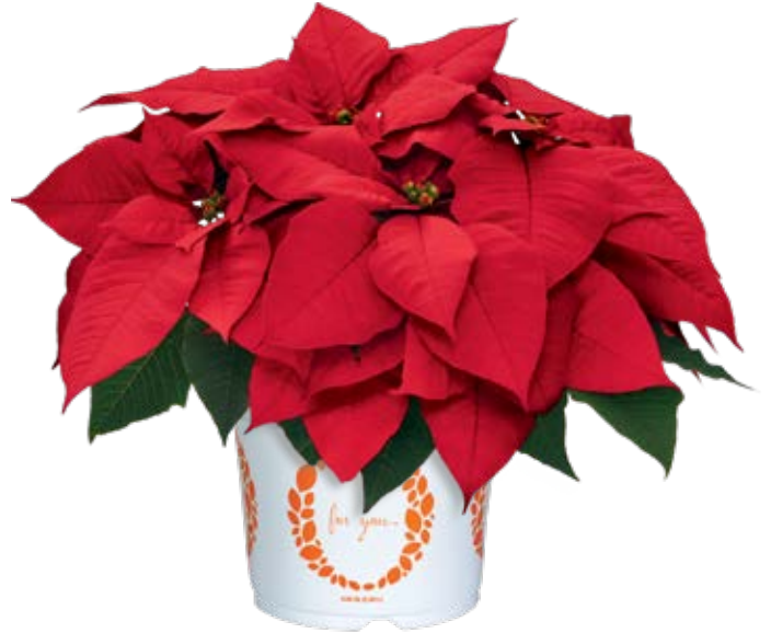
Premium Red 10230 | 7 weeks