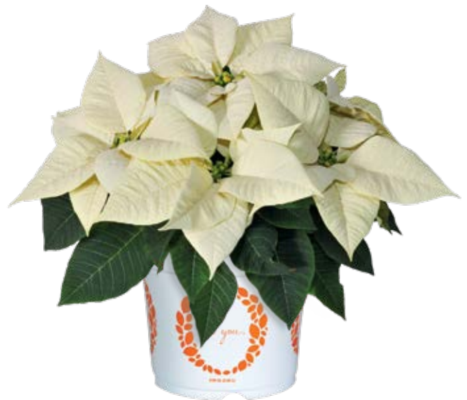
Premium White 10233 | 7 weeks