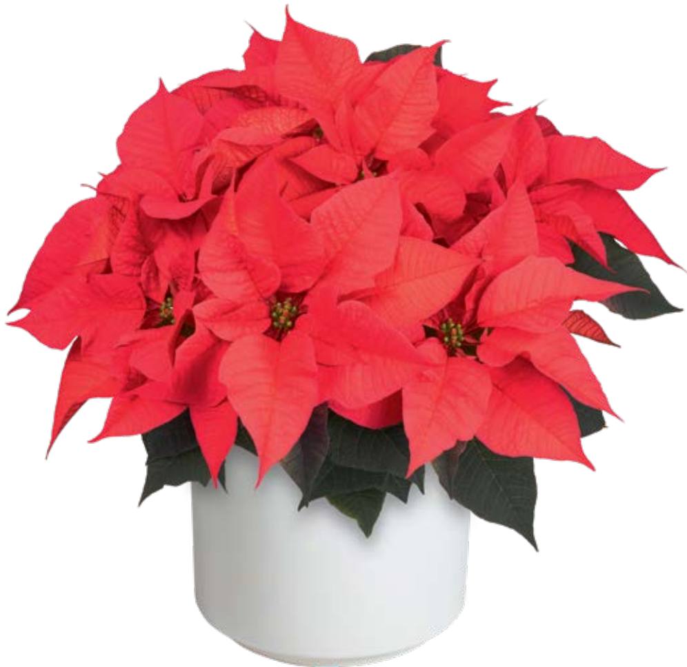
Early Polly's Pink 11055 | 8 weeks

The brightest pink bracts available in a poinsettia. Early Polly's Pink displays an extremely vibrant color at retail and the vigorous plants are great for larger containers and premium presentations.