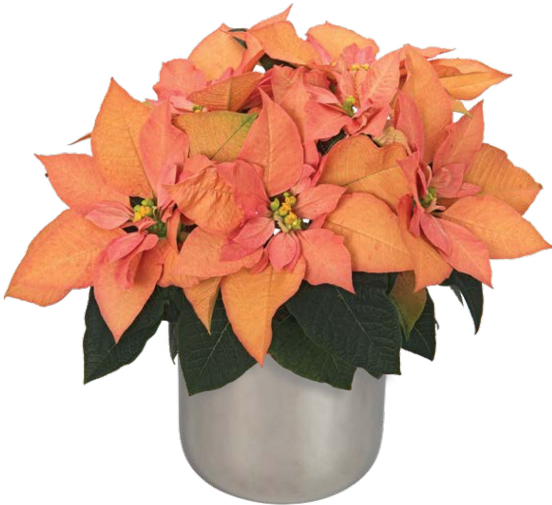
Autumn Leaves 11391 | 8 weeks

Warm golden-peach tones are ideal for Autumn sales.