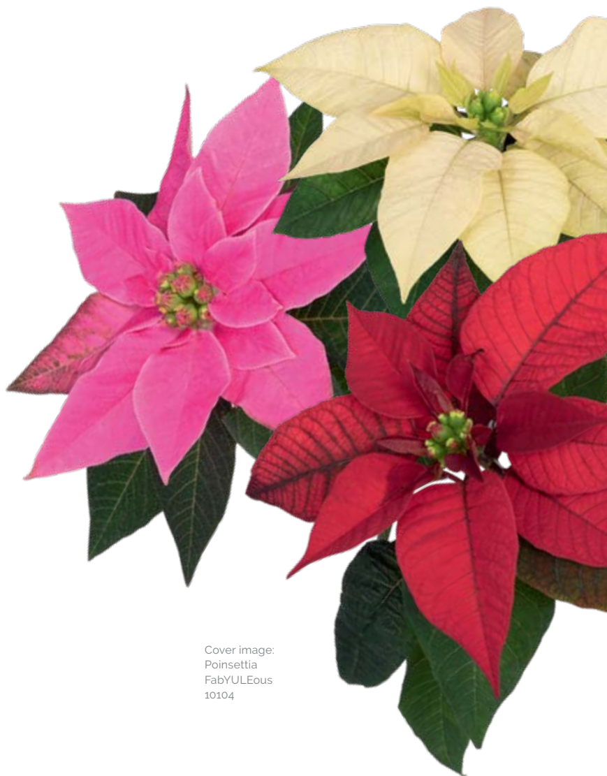
Cover image: Poinsettia FabYULEous 10104