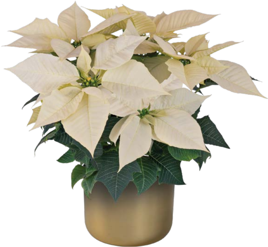
Flurry 11051 | 8 weeks

Flurry is hitting the scene as our brightest white yet. With a traditional bract presentation and dark green foliage, it will become the staple white in your program. Flurry is a robust plant from roots to shoots for production ease with controllable vigor suitable for various container sizes. Flurry is an outstanding choice for painted programs with large, flat bracts.