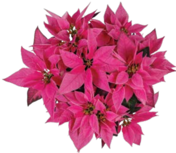
J'Adore Dark Pink 10154 | 7.5 weeks

J'Adore is the newest series of interspecific euphorbia hybrids for dynamic, modern-day holiday décor. These varieties give your program a touch of luxe with layers of velvety bracts in pastel pink and rich touchable textures. The versatility of J'Adore varieties allows us to lean on these performers from the early season, all the way through New Year's promotions, for an elegant and glamorous program.