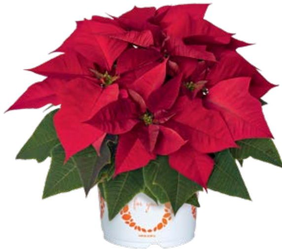
Jubilee Red 11030 | 8 weeks

The mid-season Jubilee family is available in Red, White, Pink and the novel Jingle Bells – a striking red and pink bicolored variety – and is a vigorous family with a classic bract and leaf shape. Jubilee fills larger containers well and is an outstanding performer in both hot and cold climates.