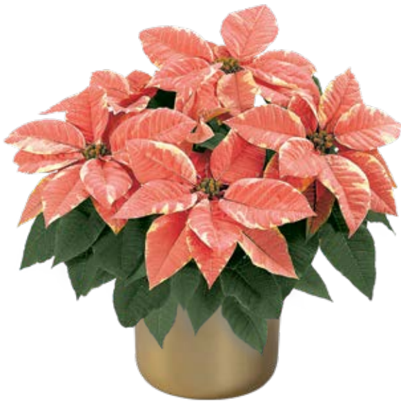
Marblestar 10419 | 8 WEEKS

The market standard for a marble. Strong, crisp color. Excellent branching.