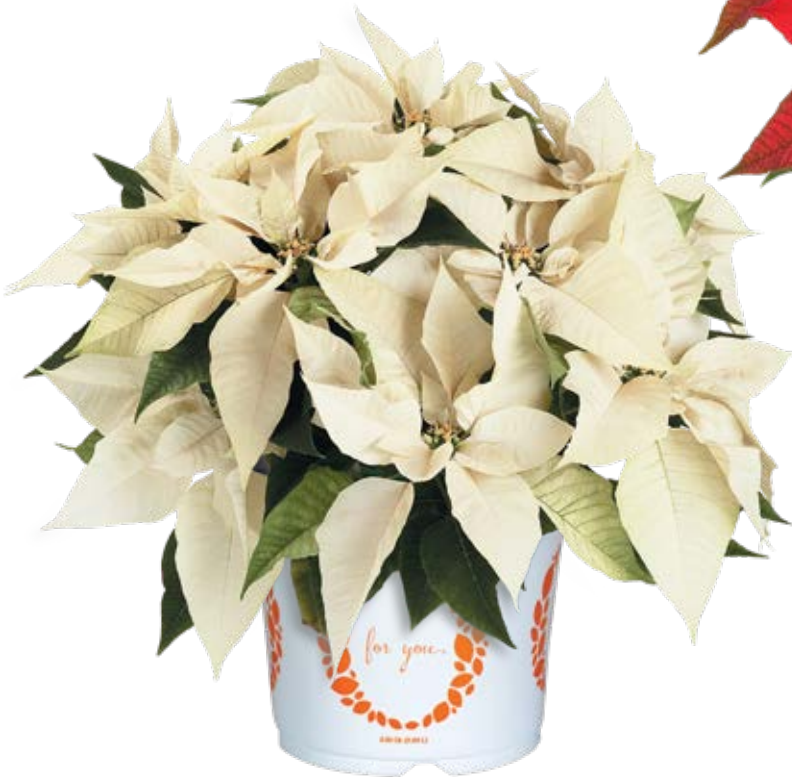
Classic White 11183 | 8.5 WEEKS

Excellent, vigorous series for straight-up color combinations and large container production.