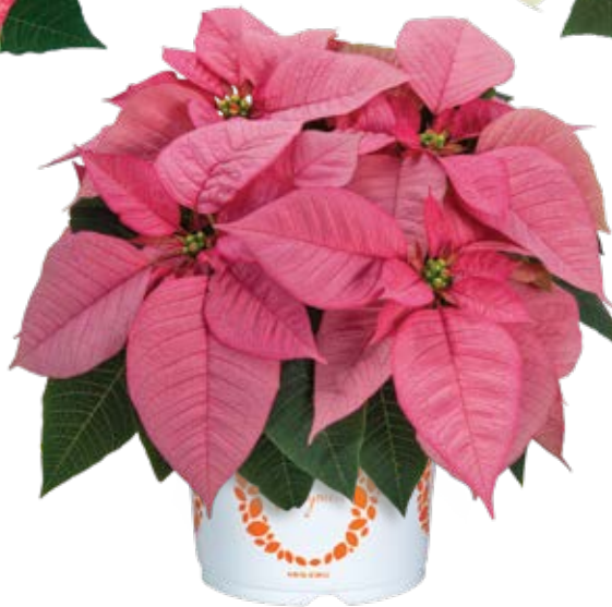
Premium Lipstick Pink 10235 | 7.5 weeks