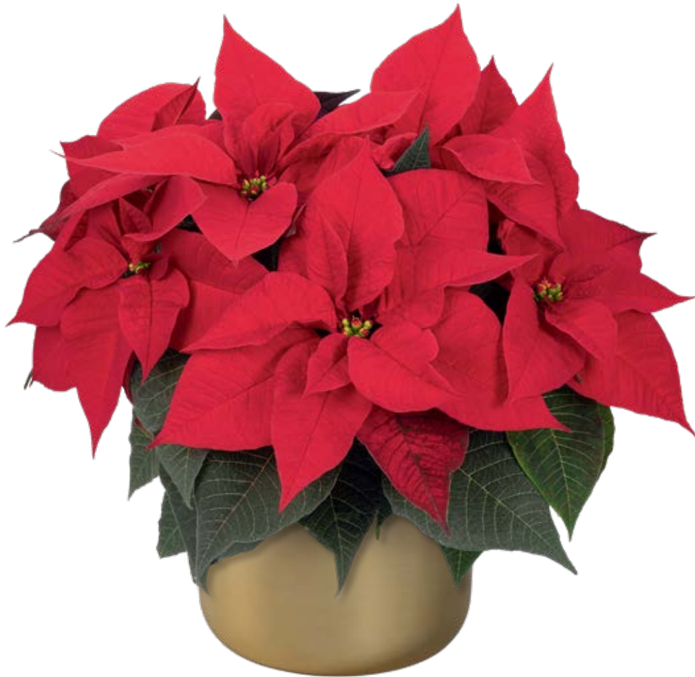
Imperial 10143 | 8 weeks

Imperial is the perfect plant for late November and early December sales. Imperial stands out with its sturdy plant structure and vibrant red large showy bracts; it adds pronounced color to any holiday presentation.