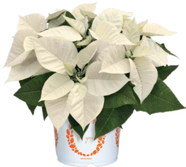
Premium Polar 10243 | 7.5 weeks