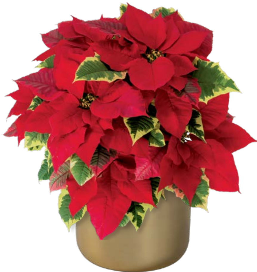
Tapestry 11107 | 8.5 weeks

Tapestry makes an elegant statement with green foliage highlighted with a luxe gold margin. Excellent for combination plantings or as a standalone decorative accent among traditional red varieties.