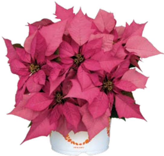
Enduring Pink 11015 | 8 weeks