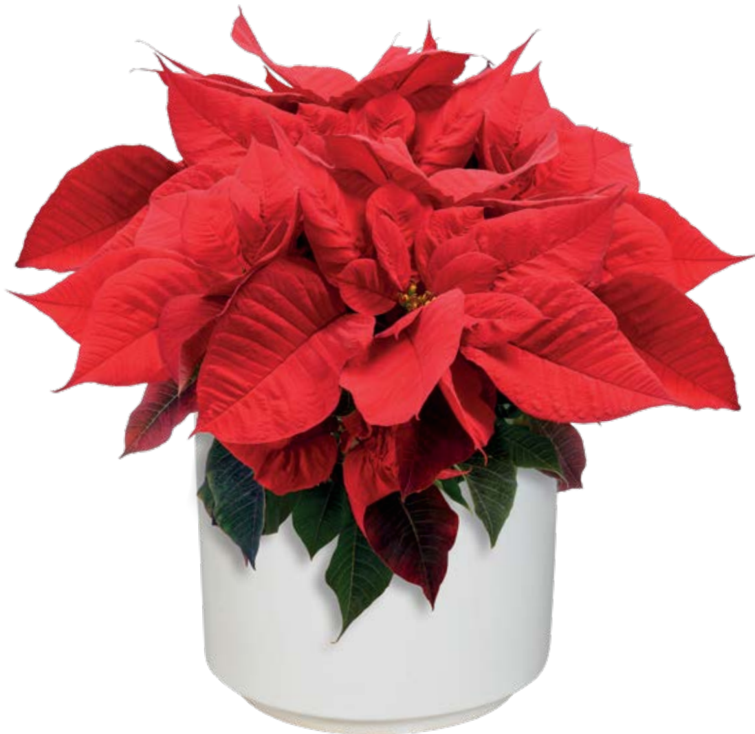
Prestigious 10120 | 8 weeks

One of our most exceptional varieties with mid-vigor and mid-season performance. The plant is extremely tough, handling dropping, sleeving, and shipping with ease. Consumers will love Prestigious with the dark-red textured bracts on a classic green foliage.