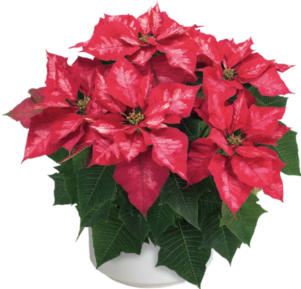
Ice Punch 11216 | 8 weeks

Ice Punch has a truly novel bicolor effect with deep cranberry-red bracts, frosted over with an icy white center.