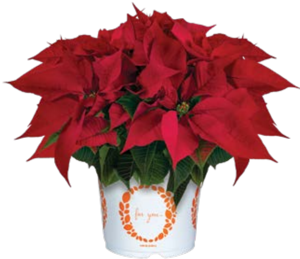
Enduring Red 11010 | 8 weeks

The Enduring family fills the mid-season holiday call with their attractive oak leaf-shaped bract in red, white, pink and marble. Enduring colors are tried and true in all regions and work well mixed in duo or tri-color pots.