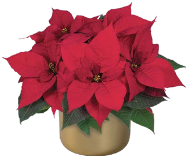
Viking Pro 10144 | 8 weeks

Offering a similar bract shape and color to the favorite Viking Red, Viking Pro exhibits a more compact stature in comparison. Attractive bracts contrast beautifully against the vivid yellow cyathia and dark green foliage.