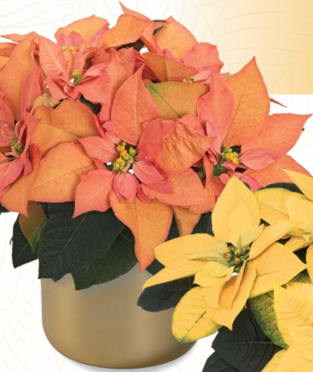
Autumn Leaves 11391 | 8 weeks