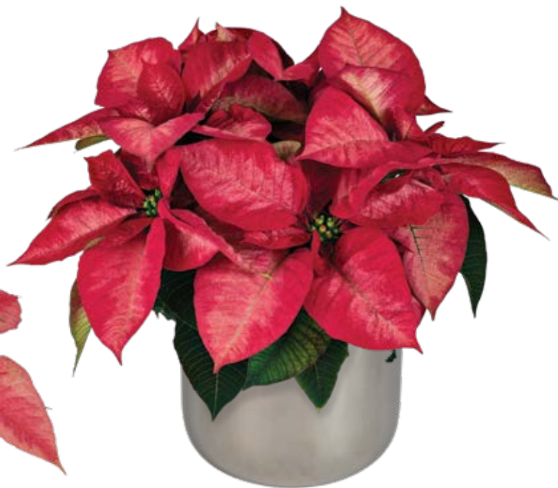
Tidings Dark Pink 11049 | 8 WEEKS