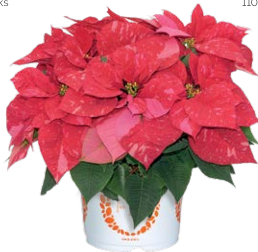
Jubilee Jingle Bells 11036 | 8 weeks