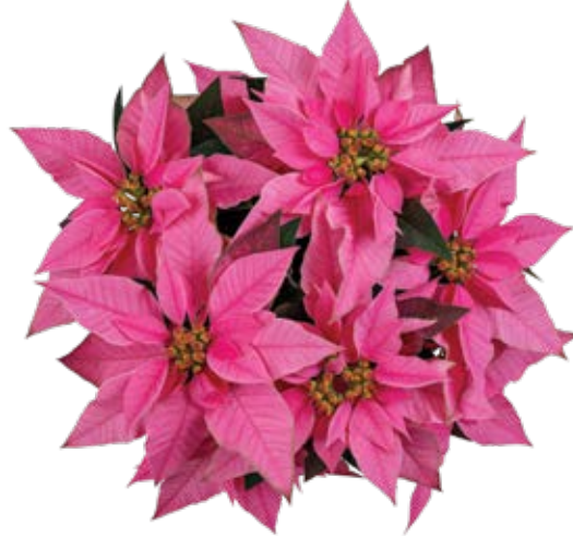
J'Adore Pink 10381 | 7.5 weeks