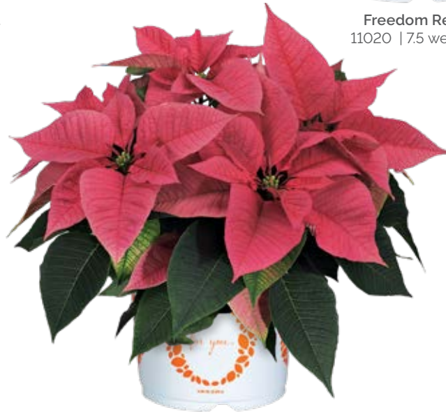
Freedom Pink 11024 | 8 weeks