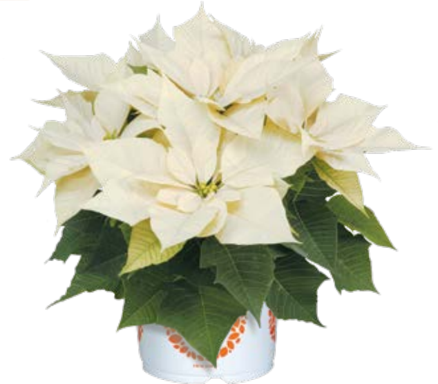
Enduring White 11013 | 8 weeks