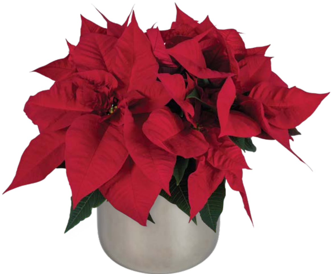
FabYULEous 10104 | 8 weeks

We believe the name speaks for itself, as this variety is nearly perfect for any situation. FabYULEous has an elegant dark-red bract color for a warm Christmas mood. The plants have a moderate habit that requires very little growth regulators.