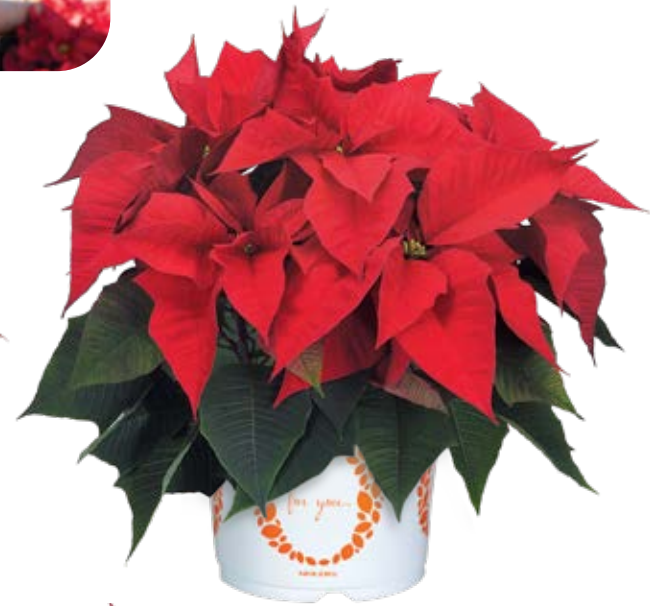
Freedom Red 11020 | 7.5 weeks