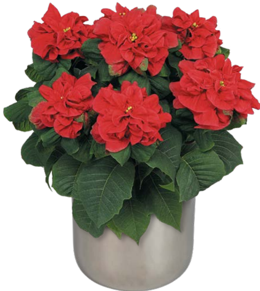
Winter Rose Dark Red 11162 | 8.5 weeks

The ruffled bracts resemble roses for a unique holiday look. The narrow plant habit is great for straight-ups and combination plantings. And originally bred from cutflower production varieties, Winter Rose Dark Red has phenomenal vase life and makes unique Christmas bouquets.