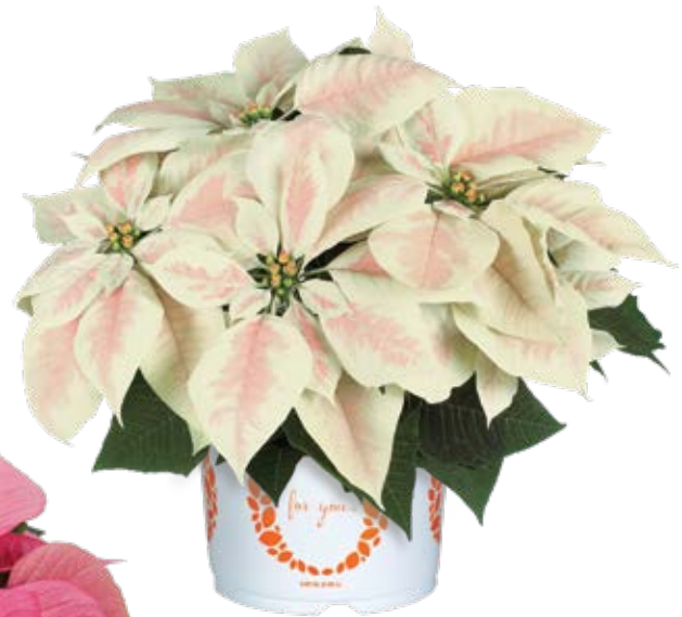
Premium Marble 10249 | 7.5 weeks