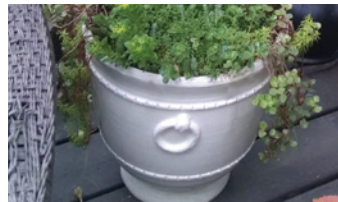
Planters & Bowls